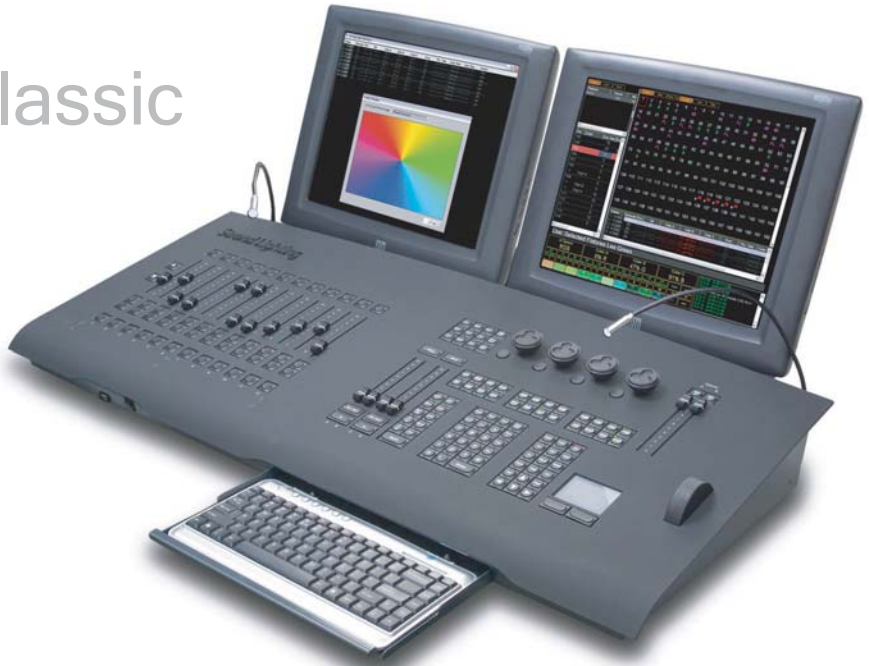
Light Palette Classic Lighting Control Console

Our industry standard Light Palette command line is built into every Light Palette console providing the intuitive interface you have come to expect from Strand Lighting.