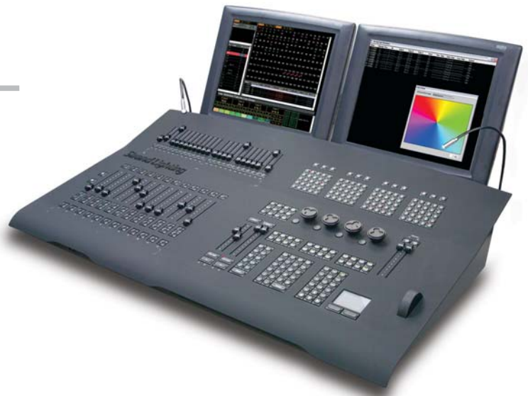
Light Palette VL Lighting Control Console

The Light Palette VL console's moving light effects generator and extensive fixture library mean that you can always get the most out of your moving light rig.