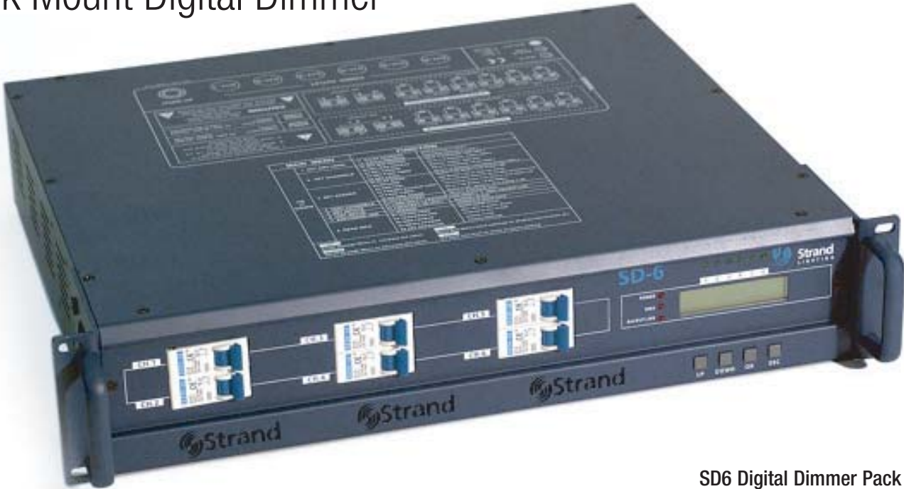
SD6 Digital Dimmer Pack

Specifically designed for 230 / 240 volt dimming markets, the SD6 digital dimmer pack offers user-friendly controls in a portable, rack mount package.