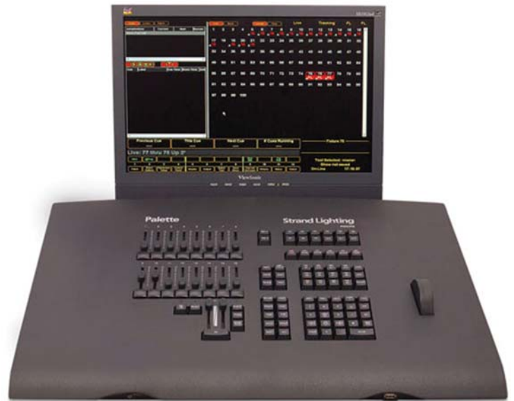
basicPalettell Lighting Control Console

Clean, elegant, and very, very powerful, basic Palette is a thoroughbred. Starting with 100 channels, a single playback and 16 submasters, basicPalettell will allow you to program complex shows, easily – elegantly.