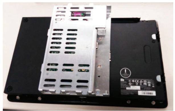
Mounted on recommended ELO monitor